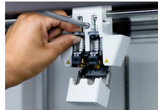
Print core CC Hardened steel nozzle for printing abrasive glass and carbon fiber composites. Available in 0.4 and 0.6 mm